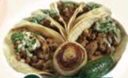
#6 6 TACOS 11.17