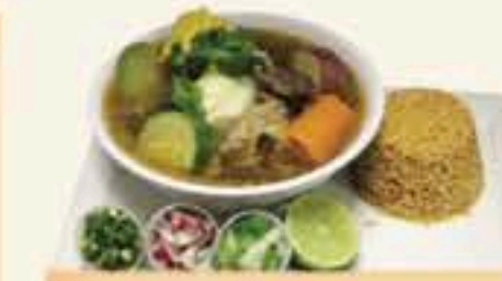
CALDO DE RES $11.90

*All shrimp & meat are cooked to order. Consuming raw or undercooked food items may increase your chance of food illness