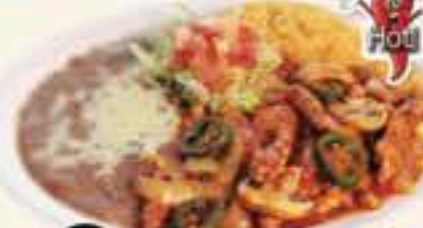
#C5 POLLO A LA DIABLA