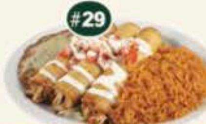
CHICKEN FLAUTAS 10.58 Fried flour tortillas filled with chicken. No tortillas