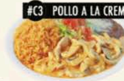
#C3 POLLO A LA CREMA