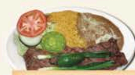
* CARNE ASADA 14.73 Skirt steak seasoned and grilled to perfection! Served with rice, beans, Pico de Gallo, Guacamole, a fried pepper and green onions & handmade tortillas.

All dishes below served with rice, beans, tortillas, unless otherwise noted.