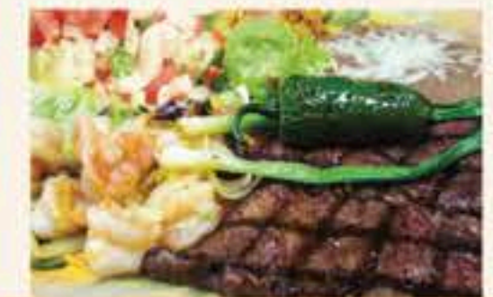
* ASADA & SHRIMP $20.29

A spicy tripe stew. Some say it's perfect for the day after too much partying!! Add oregano, onions, crushed peppers, fresh Jalapeño peppers, salsa and lime juice to your liking. Served with handmade tortillas