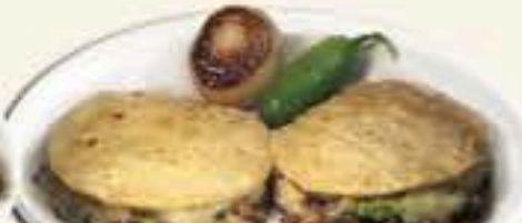
#10 (2) MULITAS 5.55

Beans, onions, cilantro, cabbage, salsa, tomato, Mexican cream, cheese. ASADA add .27c each Sopito TRIPA or LENGUA add .82c each Sopito