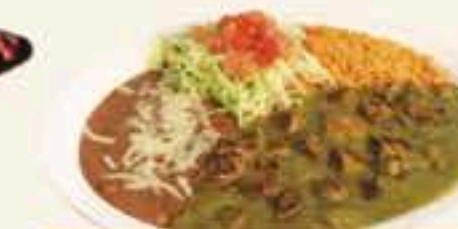
PORK IN CHILE VERDE 9.82

*All shrimp & meat are cooked to order. Consuming raw or undercooked food items may increase your chance of food illness