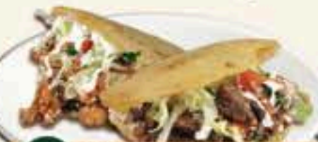
#7 (2) GORDITAS 6.61

Beans, onions, cilantro, salsa, lettuce, tomato, Mexican cream and cheese. ASADA add .27c each Gordita TRIPA or LENGUA add .82c each Gordita