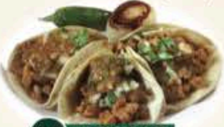
#3 3 TACOS 6.95