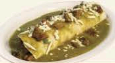
CHILE VERDE 8.02

Refried Beans, Fries, Carne Asada, Jack Cheese, Guacamole, Salsa, Bell Peppers & Onions.