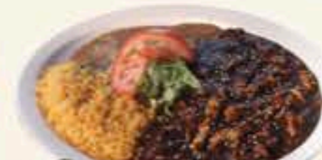
#C4 POLLO EN MOLE