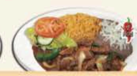
STEAK RANCHERO 11.90 Tender New York steak slices cooked in a spicy sauce with onions, bell peppers, tomatoes & spices. With rice, beans, Pico de Gallo & tortillas.

*All shrimp & meat are cooked to order. Consuming raw or undercooked food items may increase your chance of food illness