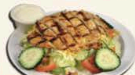
CHICKEN SALAD 9.25 No rice, beans or tortillas.

All dishes below served with rice, beans, tortillas, unless otherwise noted.