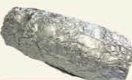
BURRITO CALIFORNIA 7.70

Meat choice, rice, beans, onions, cilantro, salsa, cilantro, Guacamole & sour cream extra. Add Tripa or Lengua $1.20 Add Asada .55c