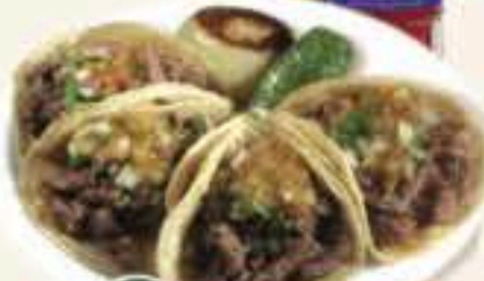
#4 4 TACOS 8.29