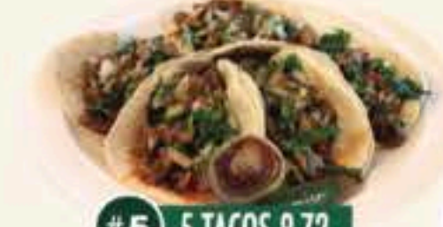
#5 5 TACOS 9.72