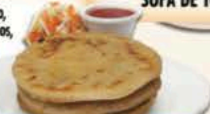
(3) PUPUSAS 7.37