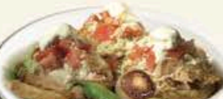
#9 (3) SOPITOS 8.29

Jack cheese, onions, cilantro, salsa lettuce, Guacamole & Cream Extra Add Lengua or Tripa $1.80 Add Asada .82c