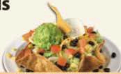
SUREÑO TACO SALAD 9.25

Meat Choice. Topped with olives, sour cream, guacamole, jalapeños. Add Lengua or Tripa $1.80 Add Asada .82c