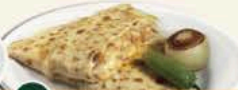
#8 QUESADILLA 8.29

Beans, onions, cilantro, salsa, lettuce, tomato, Mexican cream and cheese. ASADA add .27c each Gordita TRIPA or LENGUA add .82c each Gordita