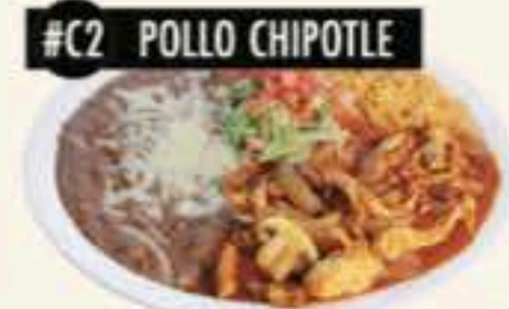
#C2 POLLO CHIPOTLE