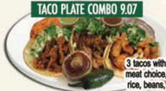
TACO PLATE COMBO 9.07

3 tacos with meat choice, rice, beans, pico de gallo.