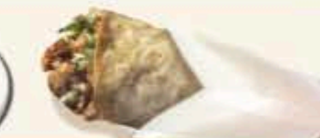
ANTOJO BURRITO 3.60

With Meat choice, beans, onions, cilantro, salsa, Jack cheese. Chipotle sauce, topped with Jack & Cheddar cheese. With rice, beans, cream, guacamole. Add Tripa or Lengua $1.80 Add Asada .82c